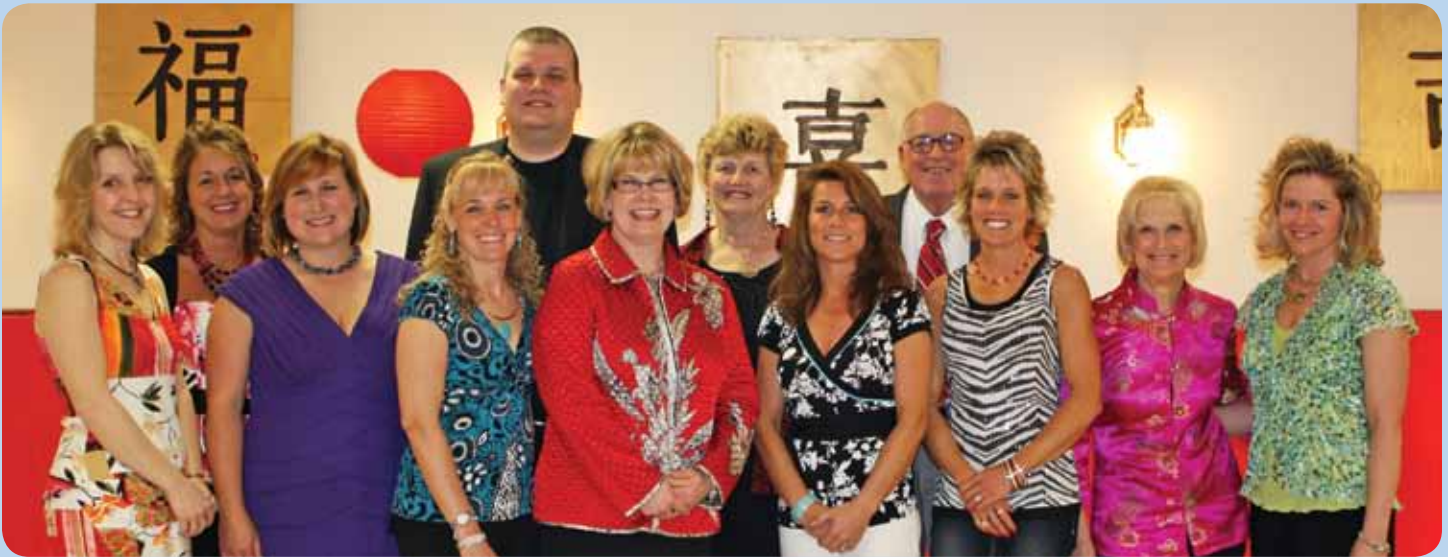
The GAH Auxiliary Gala volunteers.