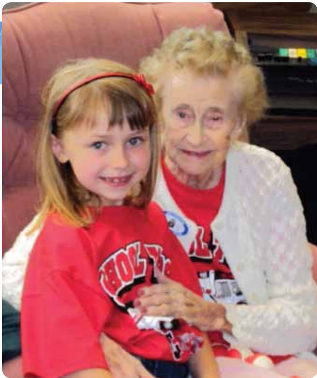
A PBL 1st grader takes time to talk with GAHHS Annex resident.